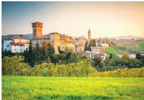
Italy is a production hotbed

with Reed, predicting that it may take time for the impact of the new DOC to be felt in the market. "Over the long term it might boost the reputation of the variety worldwide, but at Babich we think this would mainly be for the benefit of the Italians producing Pinot Grigio," he says.